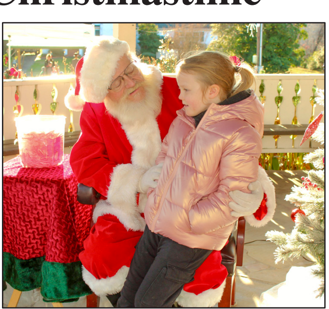
Santa Claus made an appearance at Light Up Hiawassee, to the delight of children in attendance.

Particularly popular this year was the bonfire on the square, which provided some warmth to stave off the biting wind. Families of all ages, including sightseeing young couples and even friendly pet parents, strolled around the ga-