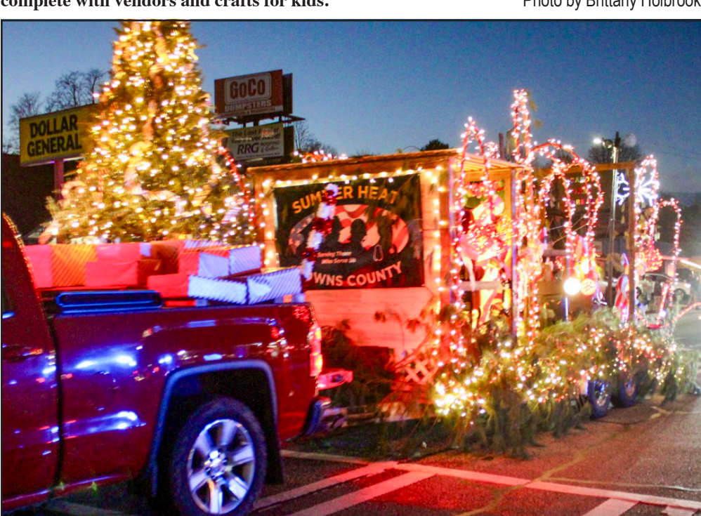
Summer Heat of Towns County won First Place in the TCSO Christmas Parade on Satur