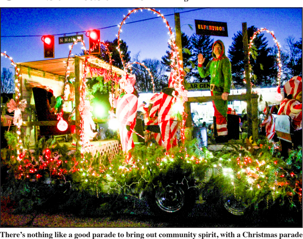
especially putting cheer in the air.

the organizers of the Summer Heat Festival dressed up as elves, smiling and waving from a trailer done up in the style of a winter wonderland. Incidentally, Summer