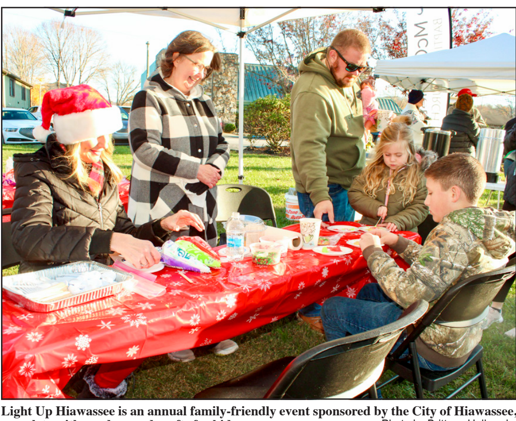
complete with vendors and crafts for kids.

To view other local holisite of Lake Chatuge Chamber