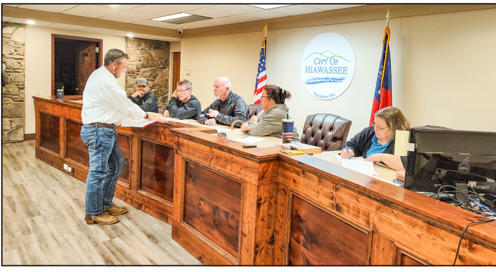
The man responsible for an upcoming housing development on Whiskey Mountain met with the Hiawassee Building and Planning Committee last month.