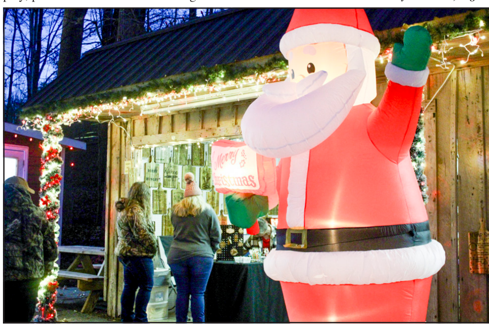
Come on out to the Mountain Country Christmas in Lights, which continues this weekend and throughout the month.

"We're very excited to See Country Christmas, Page 6