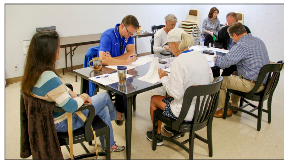
The School Board met recently to choose a millage rate to meet the system's budgetary needs, which will enable another tax break.

state each year, with growing See Tax Break, Page 5